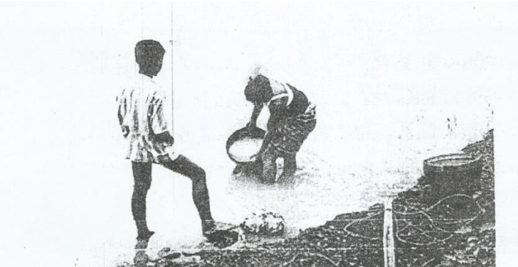
Figure 4: People in Nepal are forced to Use polluted water sources (Notice water colour)

and dysentery, and other water-borne infections. Water scarcity can lead to diseases such as trachoma (an eye infection that can lead to blindness), plague and typhus. Figure 4 shows a woman and child fetching an abundant but scarce (polluted) resource in Nepal.